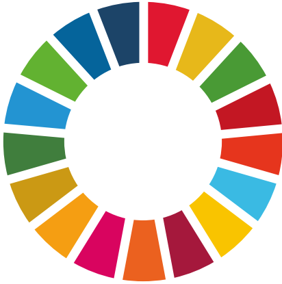
DEME supports the Sustainable Development Goals

We refer to our yearly Sustainability Report for further info.